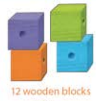
12 wooden blocks