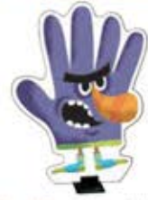
1 Stack Smasher with stand